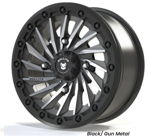
Black/ Gun Metal