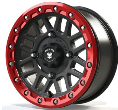
Gun Metal / Red

Here comes the cavalry. This irresistible and timeless Italian heritage sixteen-spoke design embodies the sharp and curvy soul of the SABER. With its gunmetal gray finish accented with Bullite's signature red, this Beadlock rim ensures performance and durability for the harshest terrains.