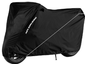
DEX-SPRT 900005 109.95